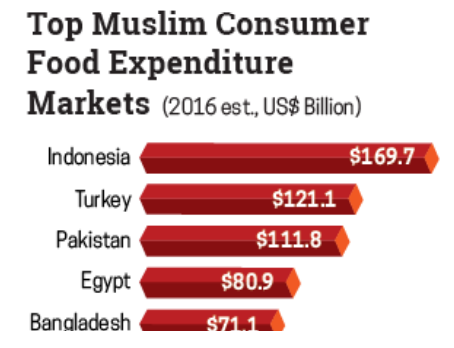
Data State of the Global Islamic Economy Report 2017/2018

In addition, Indonesia is a country where Halal Food Consumption is ranked 1 in the world <sup>50</sup>. Based on the records of the Global Islamic Economy Report 2016/2017, the global Muslim population spending on products and services in the halal economic sector reached more than USD 1.9 trillion in 2015. At the same time, the assets of the Islamic financial sector are estimated at USD 2 trillion, followed by the food sector. and beverages amounting to USD 1.2 trillion, the clothing sector (USD 243 billion), media and recreation (USD 189 billion), travel (USD 151 billion and medicines and cosmetics (USD 133 billion).<sup>51</sup> Indonesia ranks first as the largest consumer of halal products in the food and beverage sector, with total sector expenditure of USD155 billion.<sup>52</sup>